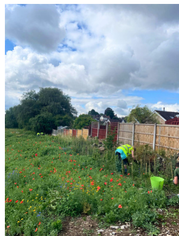
Volunteers at work